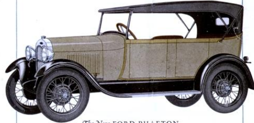
The New FORD PHAETON

A big, roomy car. Wide seats. Generous leg room, front and rear. Four convenient doors. Unusually large windows. Rich Upholstery. Attractive colors.