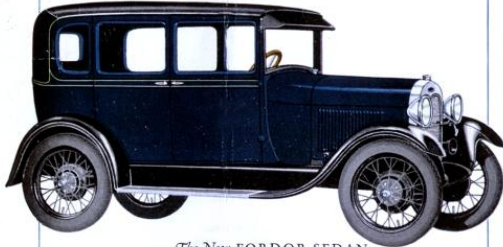
The New FORDOR SEDAN

Long, wide, roomy. Narrow pillars and new door construction give unusual vision. Both front seats fold forward, giving easy access to rear seat. Ample space between seats.