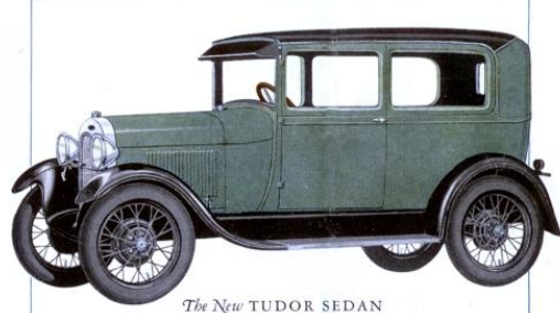
The New TUDOR SEDAN

A long, low, slaming car. All steel body, of course. Wide doors. Deep cushions. Rich upholstery. Nickel hardware. Rumble seat optional. Artistic colors.