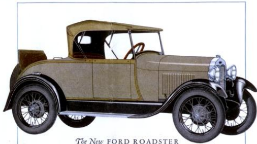
The New FORD ROADSTER

A long, low, slaming car. All steel body, of course. Wide doors. Deep cushions. Rich upholstery. Nickel hardware. Rumble seat optional. Artistic colors.